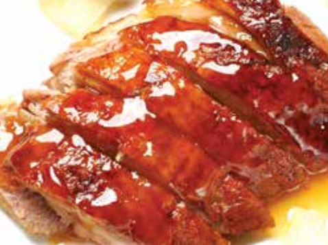
96. Duck with Plum Sauce