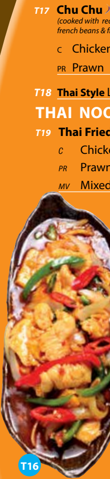
Thai Special Sweet & Chilli - Chicken