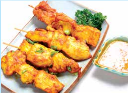
19. Chicken on Skewer