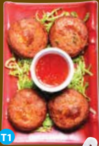
T1 Thai Fish Cake (4)