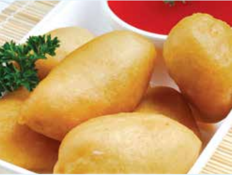
141. Sweet & Sour - Chicken Balls in Batter