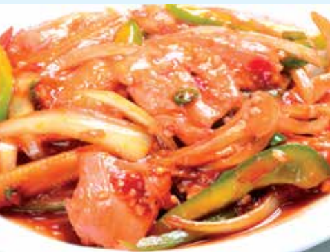
118. Szechuan - Chicken