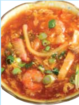
39. Hot & Sour Soup