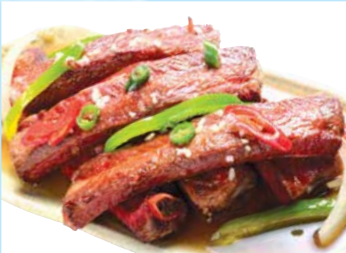
12. Spare Ribs with Honey & Chilli Sauce