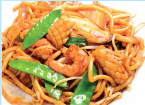
31. Mixed Seafood Udon in XO Sauce