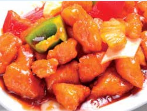
143. Sweet & Sour - Chicken Cantonese Style