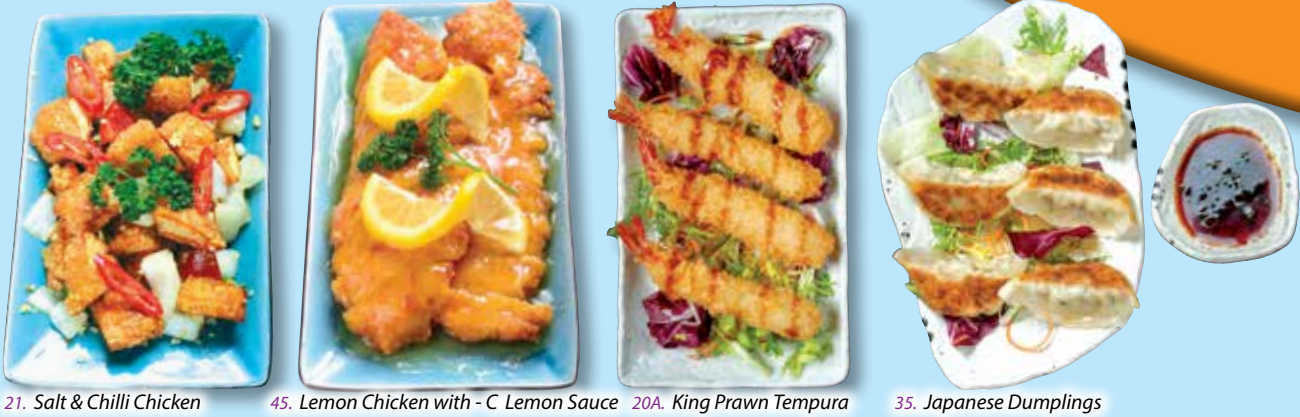
21. Salt & Chilli Chicken 45. Lemon Chicken with - C Lemon Sauce 20A. King Prawn Tempura 35. Japanese Dumplings

OPEN 6 days Closed on Mondays 4:30 pm -11:00 pm