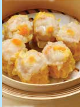
26. Sui Mei