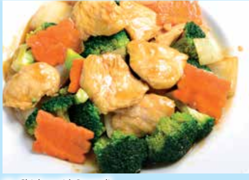
61. Chicken with Broccoli