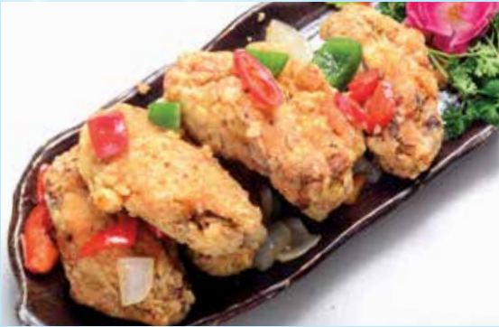
14. Salt & Chilli Chicken Wings