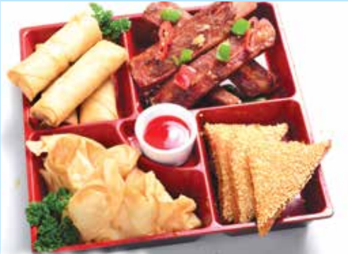
3. Starter Box (For Two)