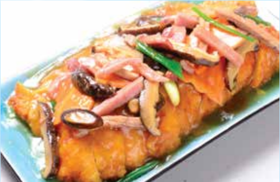
36. House Special Chicken