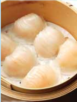
27. Hai Gow