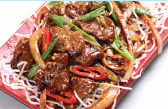
29. Mongolian Beef