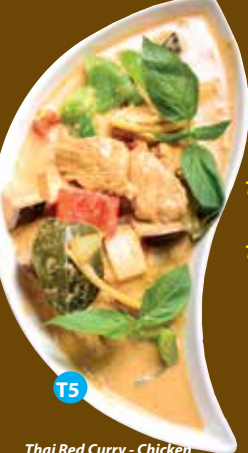
Thai Red Curry - Chicken