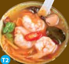
T2 Tom Yam King Prawn Soup