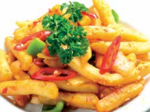
170. Salt & Chilli Chips