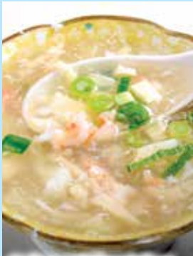
44. Dragon & Phoenix Soup